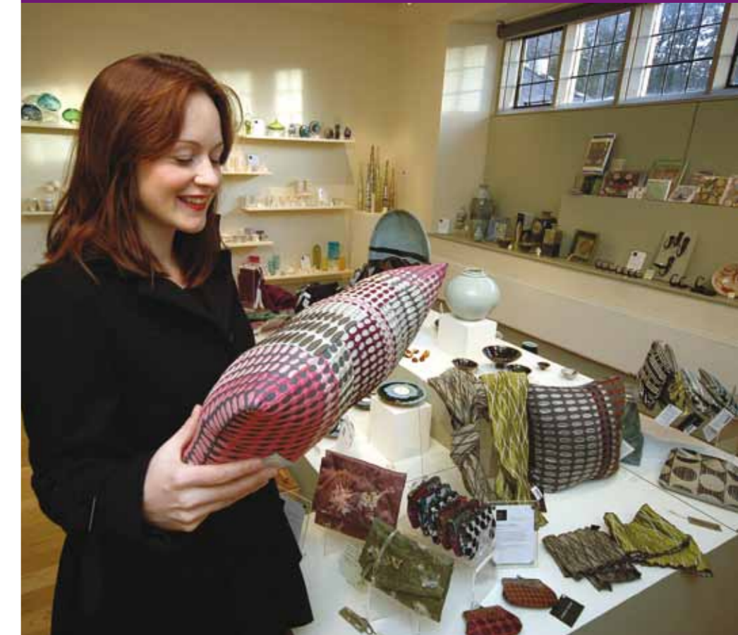
Blackwell's Craft Shop