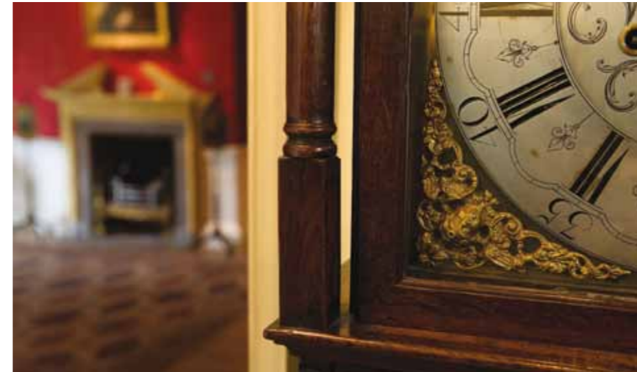
View into the Saloon at Abbot Hall

We offer competitive rates to groups of 10 or more, with additional benefits and incentives for drivers and group organisers. These include:-