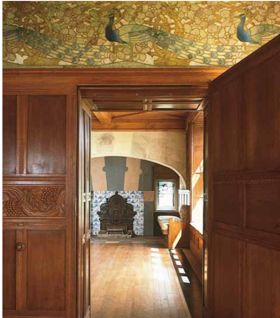
View of the Dining Room from the Main Hall at Blackwell

The Lakeland Arts Trust welcomes groups to Blackwell, The Arts & Crafts House, Abbot Hall Art Gallery and Museum of Lakeland Life & Industry all year round. We enjoy seeing the return of regular groups and introducing new groups to the beautiful properties and collections in the care of the Trust.